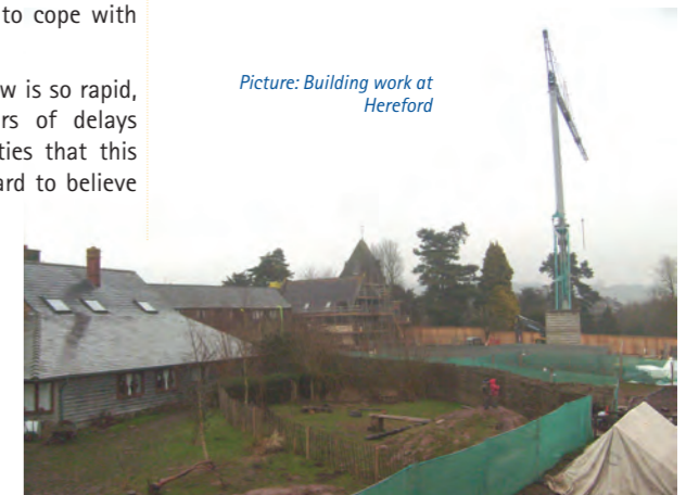
Picture: Building work at Hereford